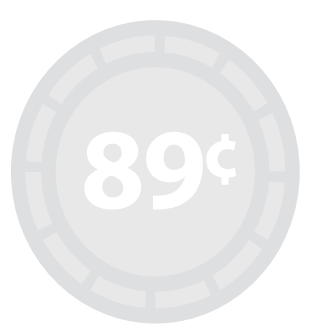
of every dollar supports the Watson Institute's programs for children with special needs.