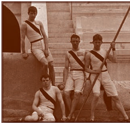
Some of the USA athletes in the 1896 Olympics.

The 1896 Olympics were the first Olympic Games since ancient times. They were held in Athens, Greece in April 1896. At that time, it was the largest international sporting event ever held. Fourteen countries, including the United States, participated.