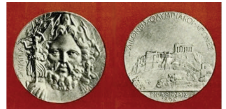
A first place medal from the 1896 Olympics

The 1896 Olympics were very popular. Over 80,000 people attended the opening ceremony.