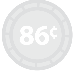
of every dollar supports the Watson Institute's programs for children with special needs